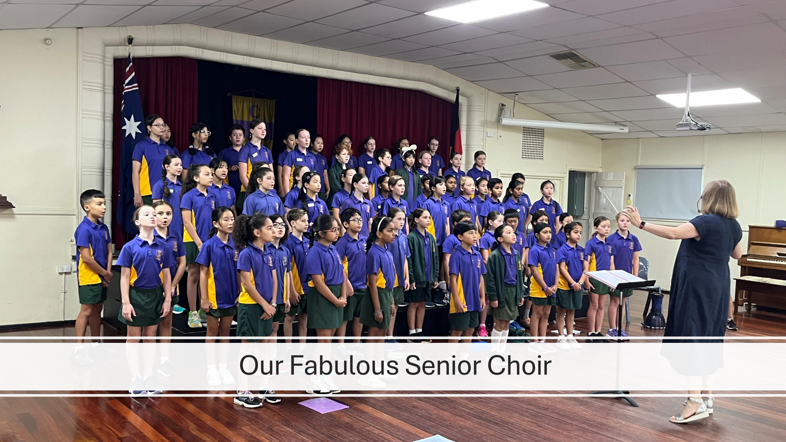
Our Fabulous Senior Choir