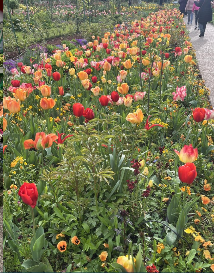
Orderliness in Monet's Garden, Giverny, France.